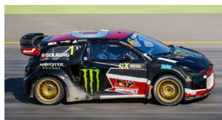
Petter Solberg, World Rallycross Team FIA World Rallycross Championship, Estering, Germany