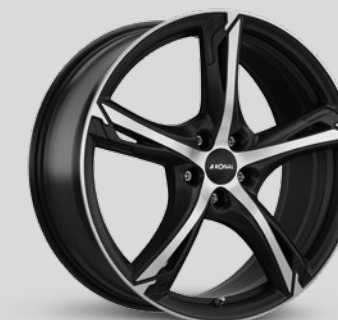
Without design elements